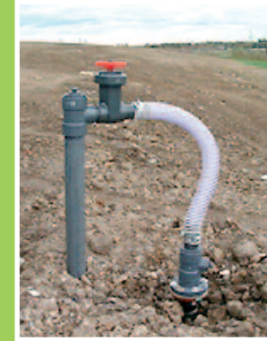
LANDFILL METHANE GAS