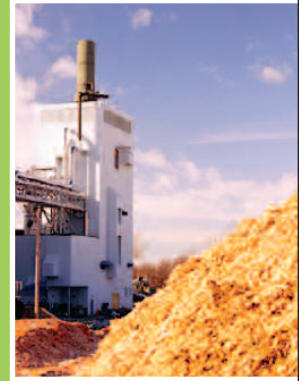
BURNING WOOD CHIPS